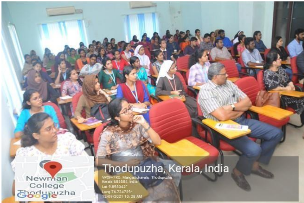
Photos of Workshop on Language and Communication Skills on 06-02-2021