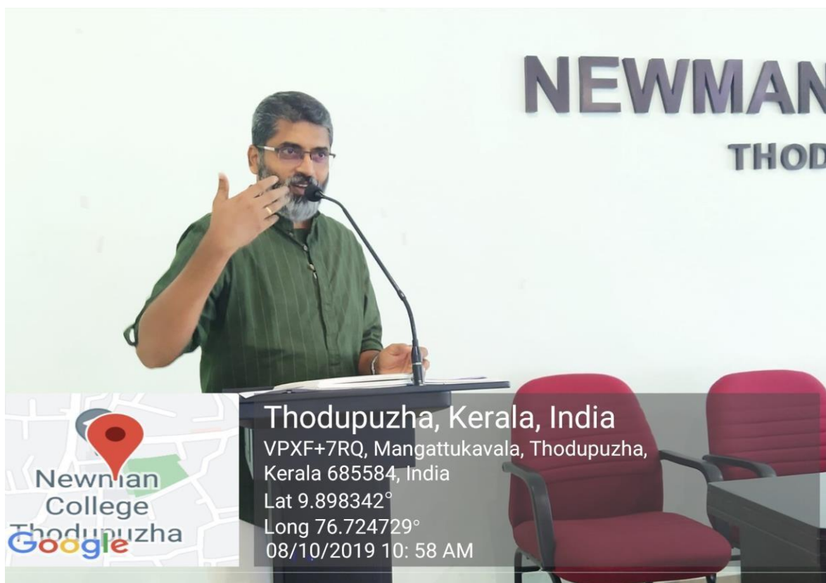
Photo of the programme Skill Enhancement Through Drama on 08-10-2019