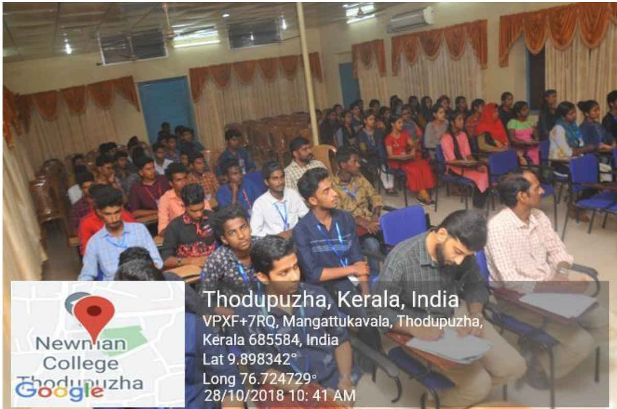
Photos of Training Programme on Communication Skill Development on 28-10-2018