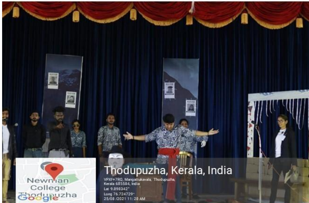
Photo of the Theatre workshop on 25-08-2021