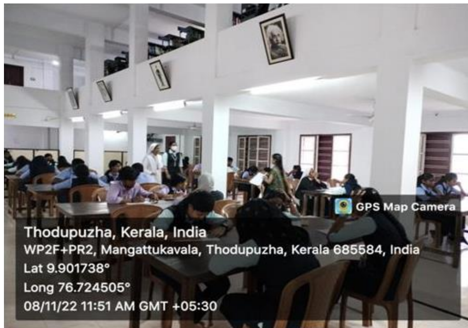
Photos of the Skill Enhancement programme on Regional Language: Reading and Writing Proficiency on 08-11-12