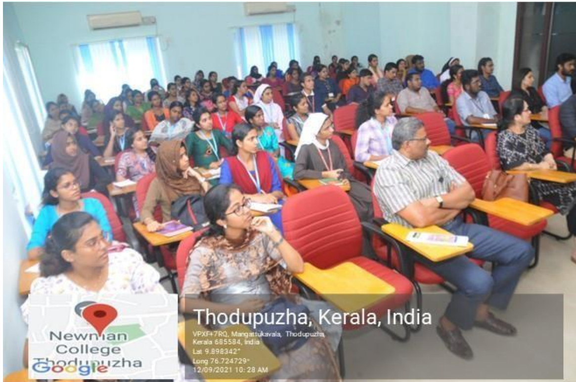
Photo of the Program 'Team Up: Symposium on Learning Language and Literature' on 12-09-2021