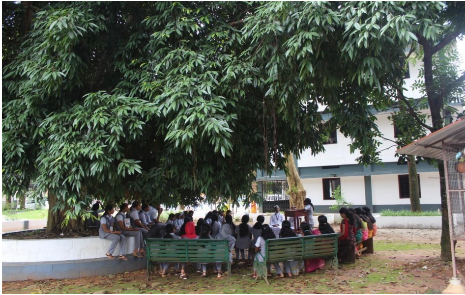
Photo of the Workshop on Effective Communication on 23 -11- 2021