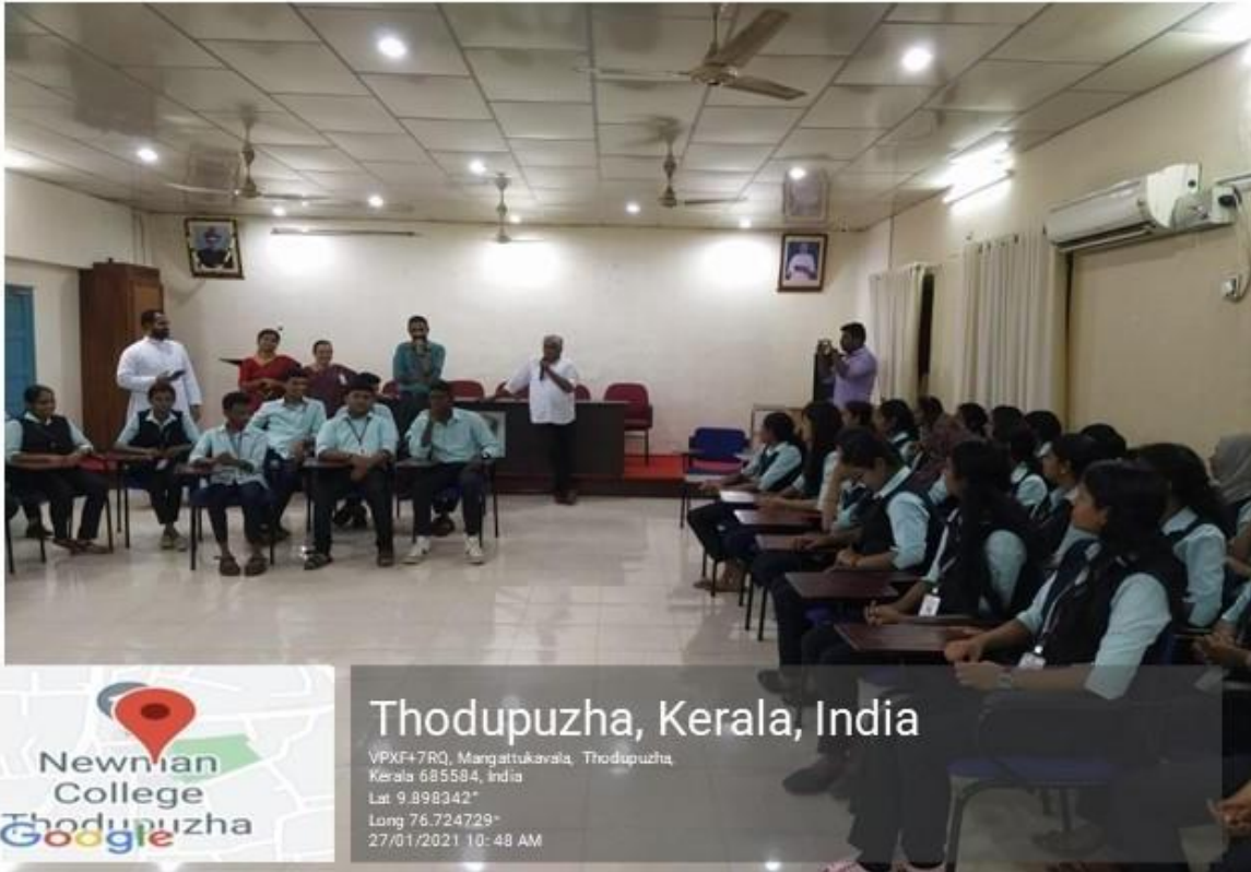
Photos of the Workshop on English Language Training on 27-01-2021