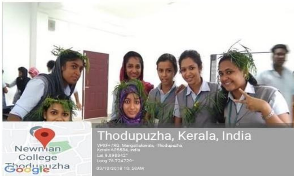
Photos of the Workshop Kalyanasougandhikam: Workshop on Language and Communication Skill Development conducted during 03-10-2018 to 04-10-2018