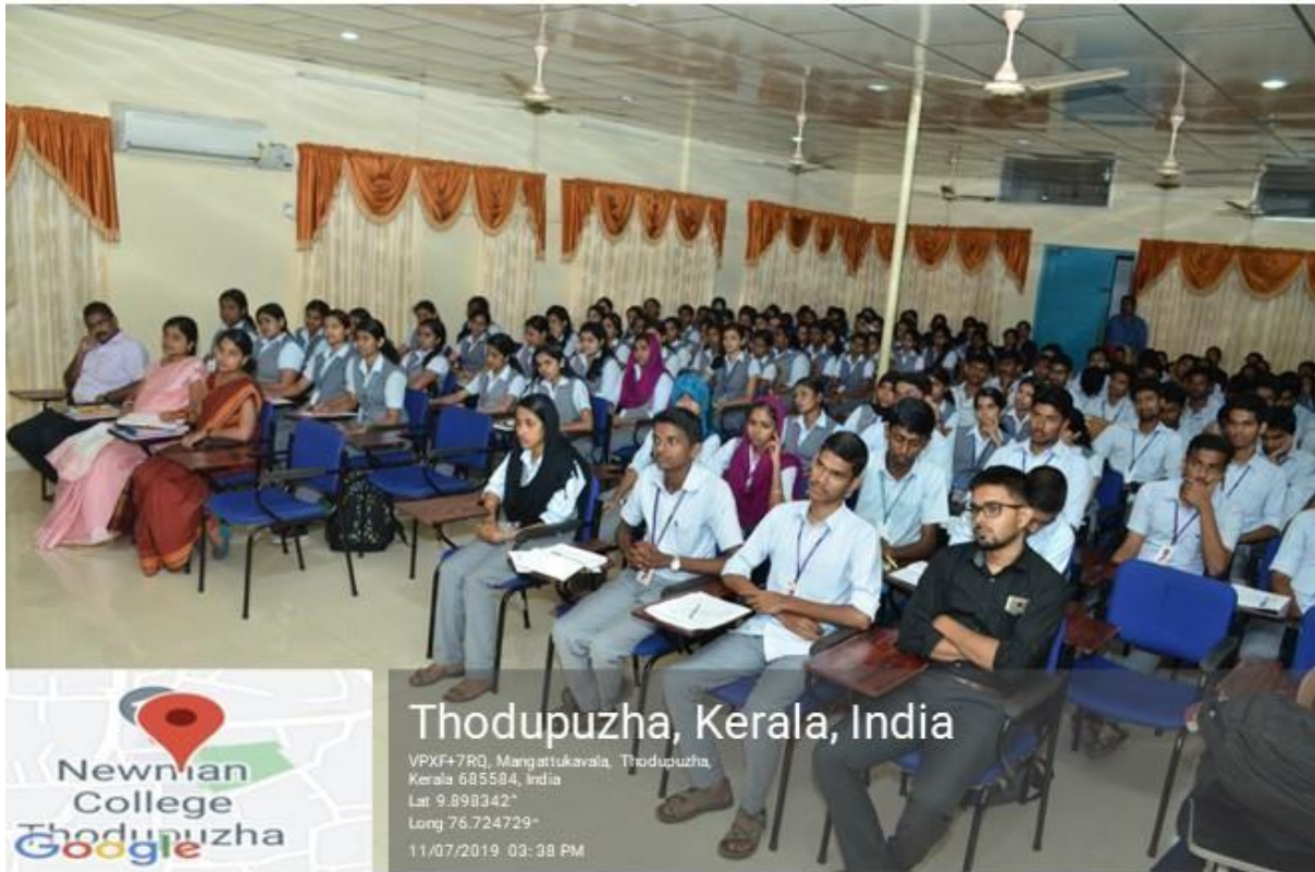
Photos of the Workshop on Mastering Language and Communication Skills on 11-07-2019