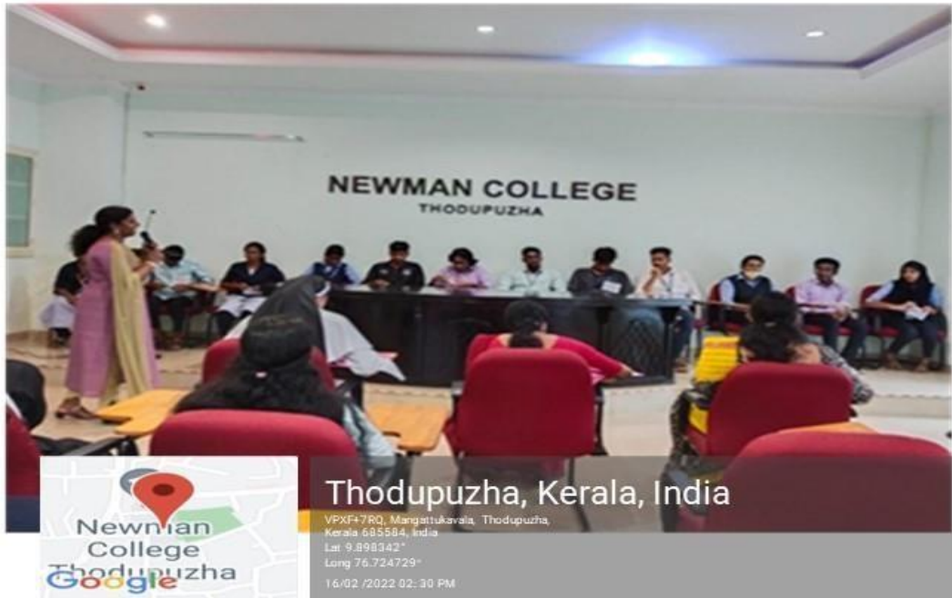
Photos of the Workshop on Regional Language and Communication Skill Development on 16-02-2022