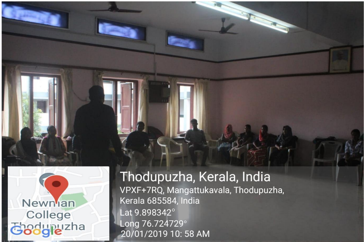
Photos of the programme communication in Professional Settings on 20-01-2019